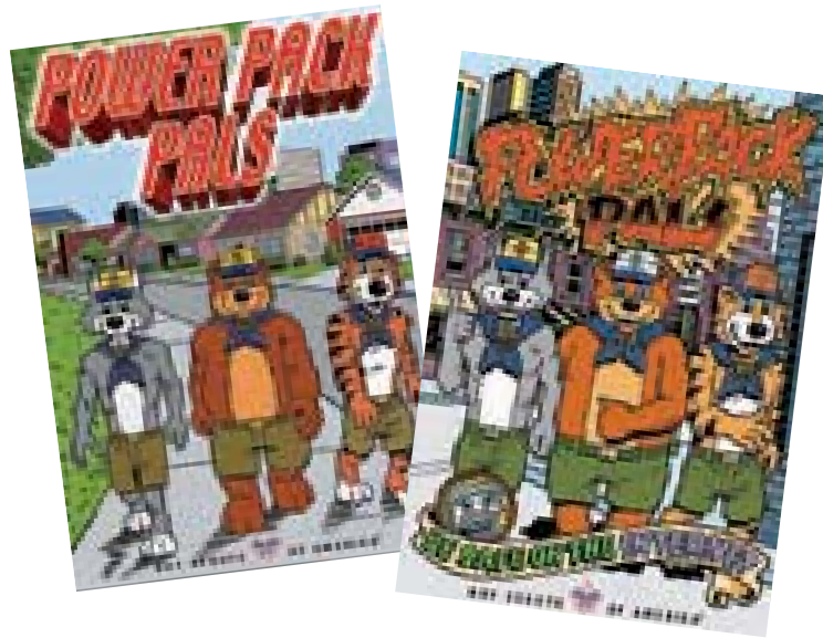
Power Pack Pals