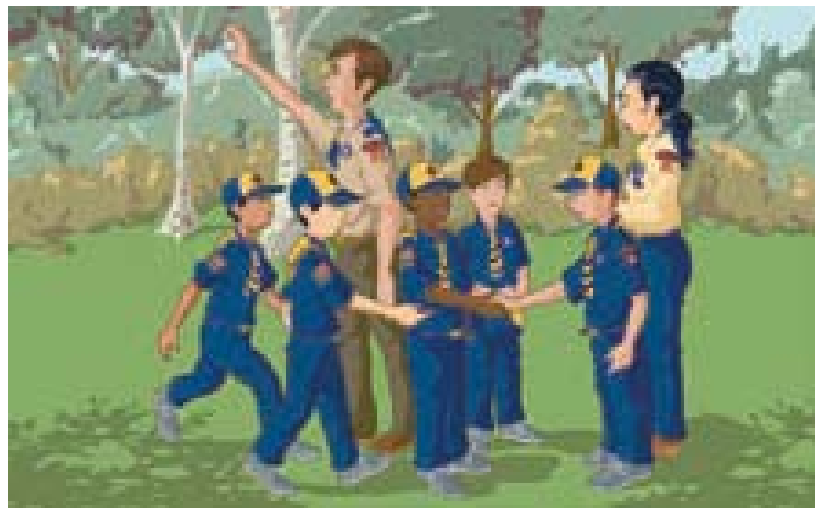
Youth Protection Guidelines: Training for Volunteer Leaders and Parents