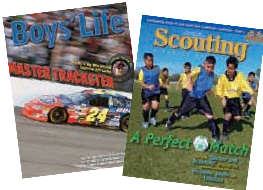
Boys' Life and Scouting magazines

In addition to the video-based training, Youth Protection training is available on the Internet through your local council's Web site. The training addresses many questions Scout volunteers and parents have regarding child sexual abuse.